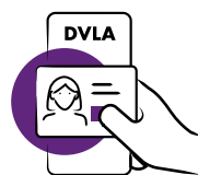
Both parts of licence