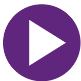
Play Video Opens in browser