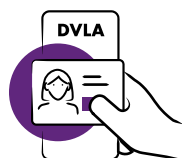
Both parts of licence

This allows you to experience the drive, the functionality of the key features of the vehicle and ensure you are happy with the vehicle of choice.