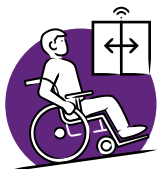
Ramped Access Automatic doors